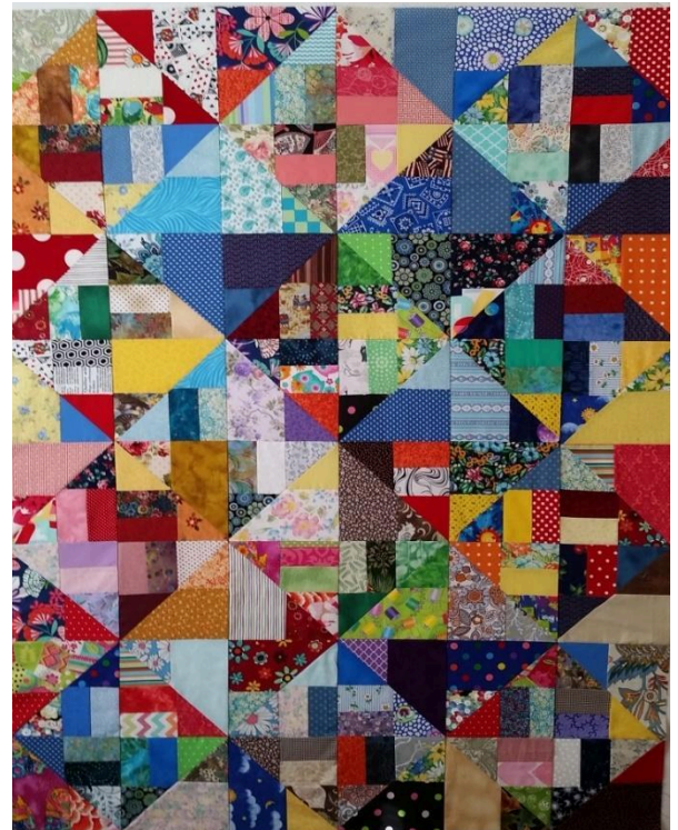
45" x 60"