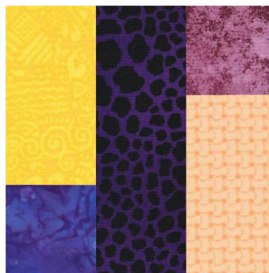
Original layout (left), Alternative Layout, same size pieces (right)

Free for personal and non-profit use. Reproduction for charitable purposes only. thelinusconnection.org